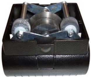
T100A (Complete Cutting Head)